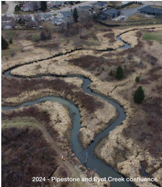
2024 - Pipestone and Eyot Creek confluence