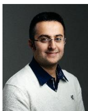
Roshan Water™ Solutions