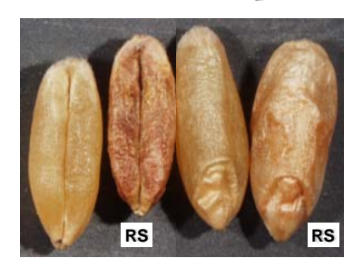
Reddish discolouration (red smudge - RS) in durum caused by tan spot fungus infection of kernels