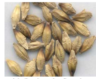
Brownish discolouration (kernel smudge) in barley caused by spot blotch fungus infection