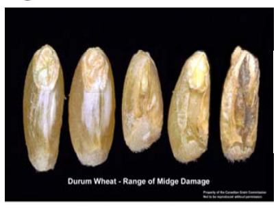
Orange wheat blossom midge damage in wheat