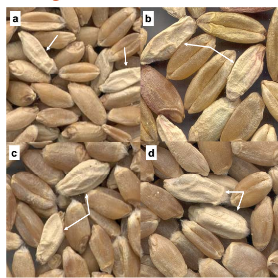
FKD in Canada Prairie Spring (a), Amber Durum (b), and Canadian Western Red Spring (c & d). Currently, FDK's in Alberta are relatively rare and typically caused by species other than F. graminearum. In Manitoba most FDK's are caused by F. graminearum