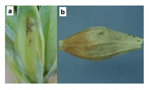
Brownish lesion (a) and orangish discolouration (b) of barley kernels due to the net blotch fungus