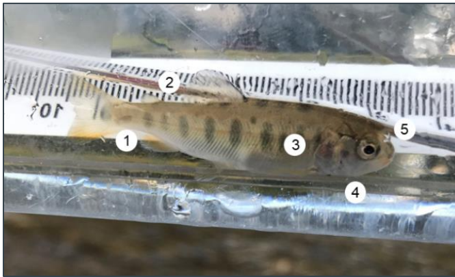
Healthy RNTR fry: