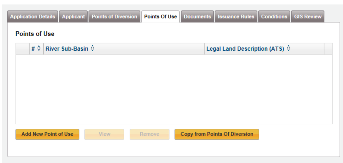
Figure 3: Add Point of Use tab