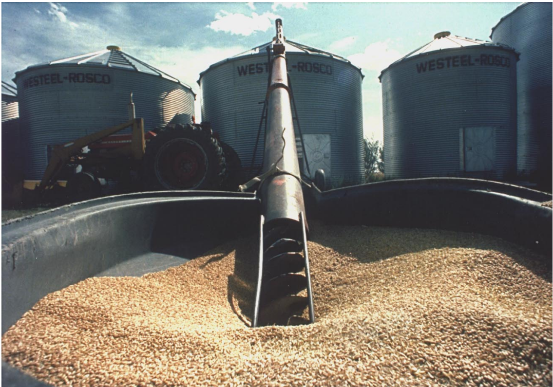
Grain Augers “clank”