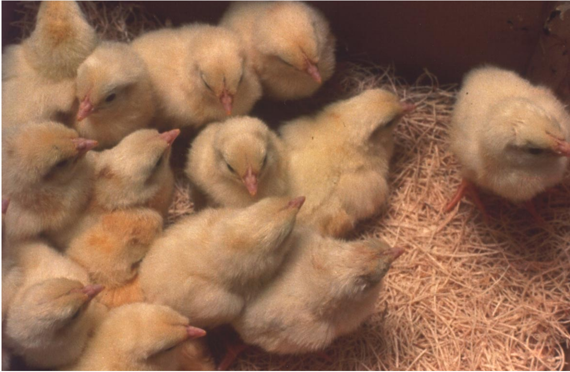
Baby Chicks “peep”